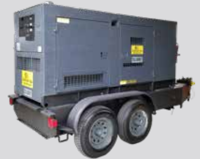
20kW - 500kW Generators