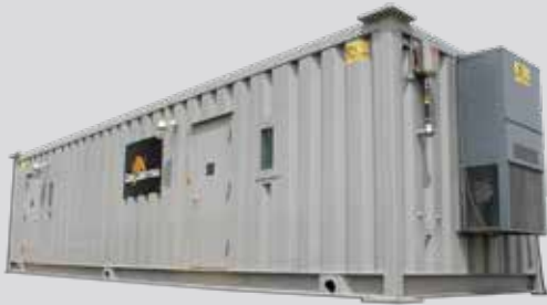
8'x40', 12'x40', 8'x20' Buildings