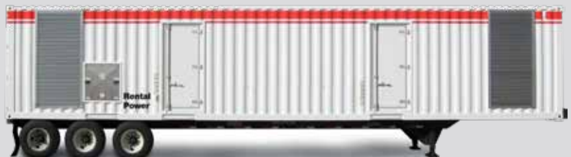
500kW - 2MW Generators