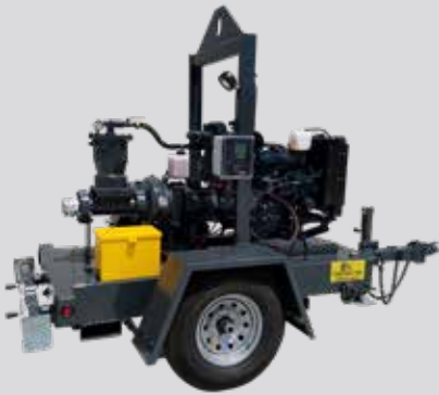
4"-18" Vac Assist & Trash Pumps