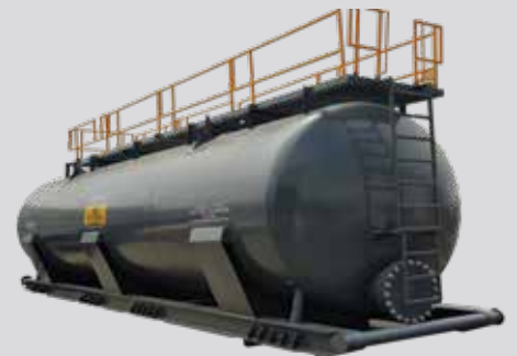
500 CGA Fluid Tanks