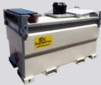
528 Gallon Fuel Tanks