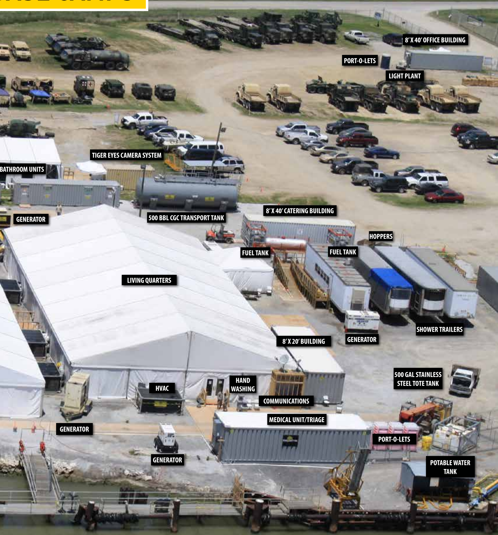
8' X 40' OFFICE BUILDING